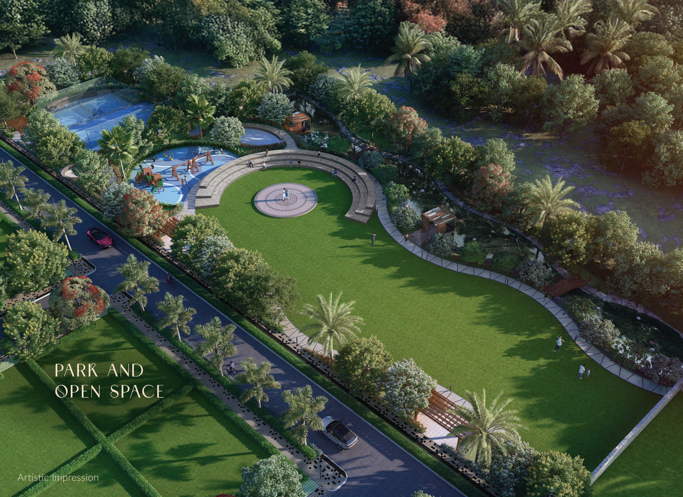
PARK AND OPEN SPACE