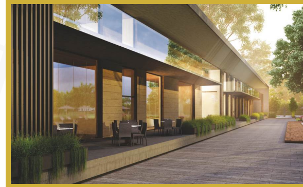
ARVIND FORRESTE Luxury villas nestled in a forest