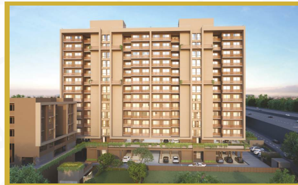
ARVIND ELAN Stylish and spacious residences