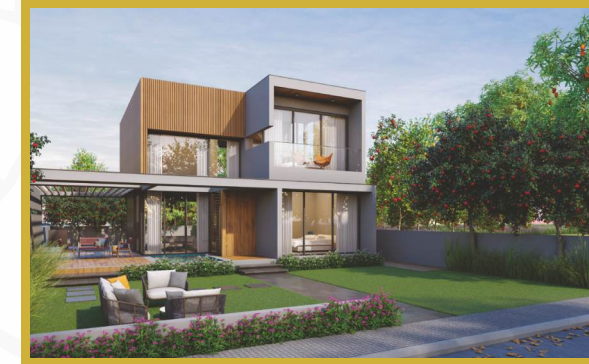
ARVIND ORCHARDS Premium villa plots