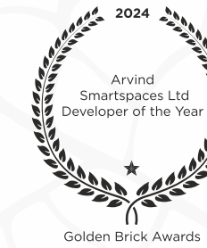
Golden Brick Awards