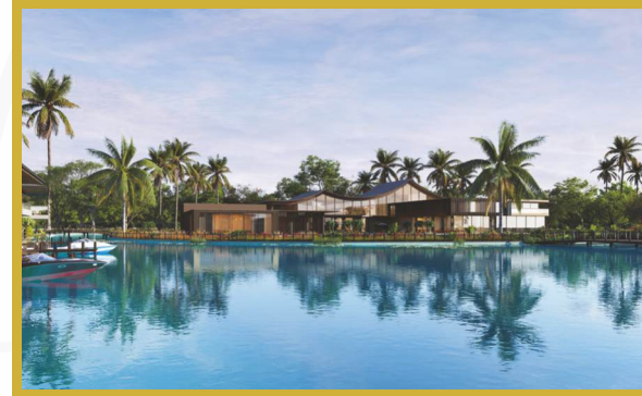
ARVIND AQUACITY Premium lakeside villas & plots