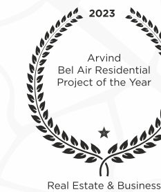
Real Estate & Business Excellence Awards