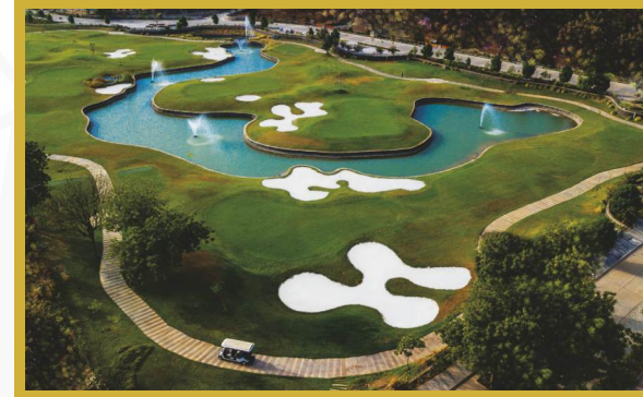
ARVIND UPLANDS Ultra-luxury golf villas