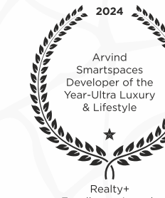
Realty+ Excellence Awards