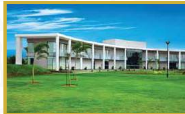
ARVIND ALCOVE Premium weekend residential plots