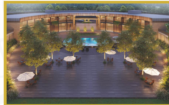
ARVIND UPLANDS 2.0 Premium golf villas & plots