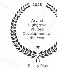
Realty Plus Conclave & Excellence Awards