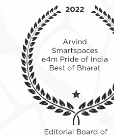
Editorial Board of Exchange4Media & Impact Magazine