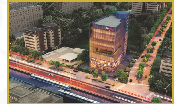
ARVIND THE EDGE Modern retail, commercial and office spaces