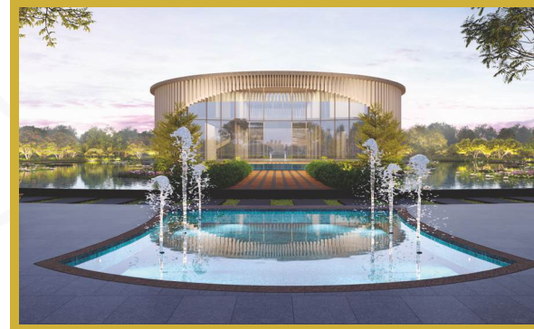
ARVIND RHYTHM OF LIFE Premium plots