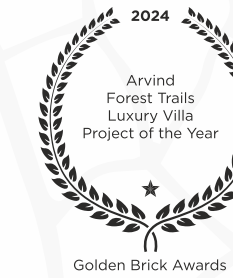
Golden Brick Awards