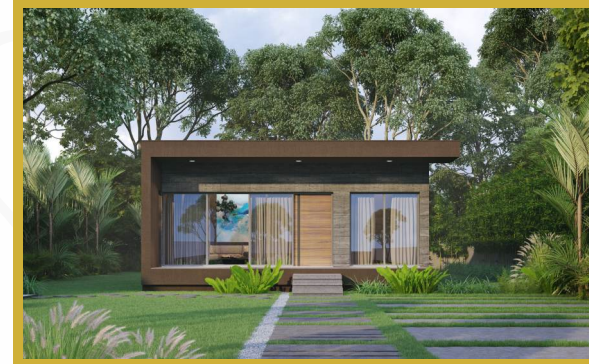
ARVIND HIGHGROVE Premium golf villas and plots