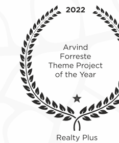
Realty Plus Conclave & Excellence Awards