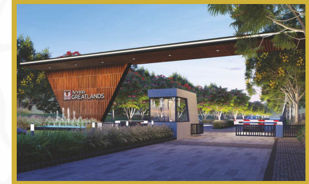
ARVIND GREATLANDS Luxury villa plots