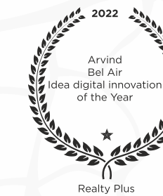
Realty Plus Idea Awards