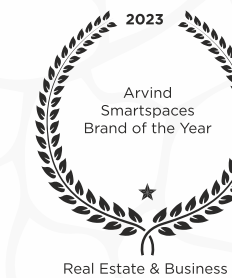
Real Estate & Business Excellence Awards