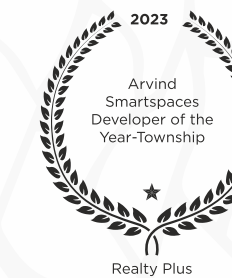
Realty Plus Conclave & Excellence Awards