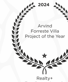
Realty+ Excellence Awards