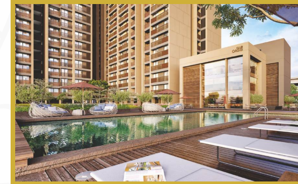
ARVIND OASIS Premium residences surrounded by soothing waterbodies