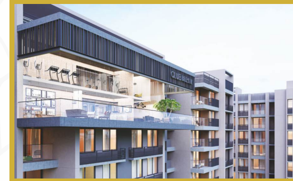
ARVIND BEL AIR Luxurious residences with unlimited lifestyle