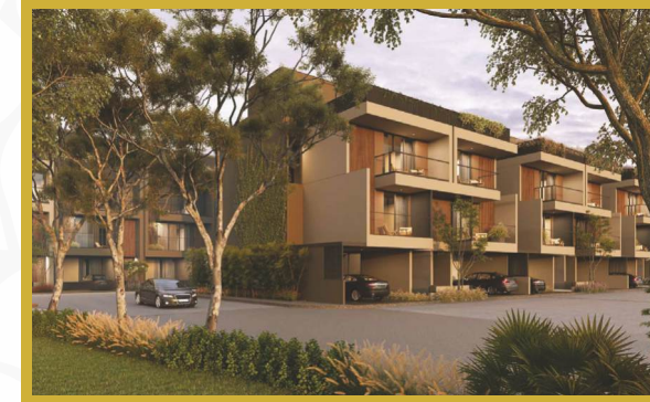
ARVIND FOREST TRAILS Luxury villas