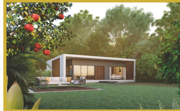
ARVIND FRUITS OF LIFE Premium weekend villa plots