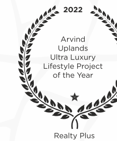
Realty Plus Conclave & Excellence Awards